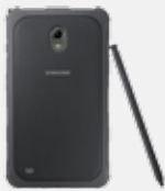
Protective Cover with C-Pen